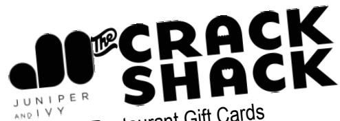
Restaurant Gift Cards Value: $75 • Opening Bid: $35