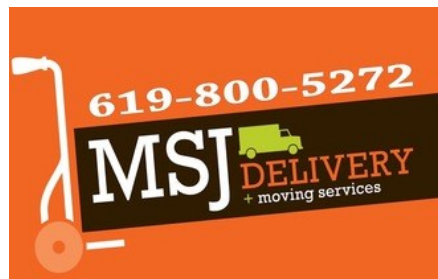
Moving/Packing/Delivery Services Value: $500 • Opening Bid: $200