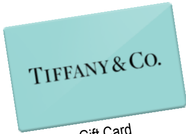
Gift Card Value: $200 • Opening Bid: $80