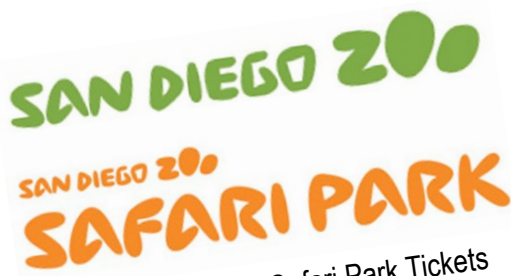
San Diego Zoo or Safari Park Tickets Value: $104 • Opening Bid: $44